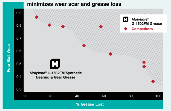
Figure 1: Molykote® G-1502FM Grease

NOTE: All four-ball wear scar results are recorded as average results of vertical and horizontal scars from three different balls.